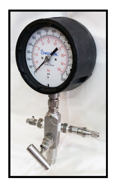
Block & Bleed Gauge Calibration Assembly